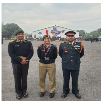
All India 2 nd Best MC