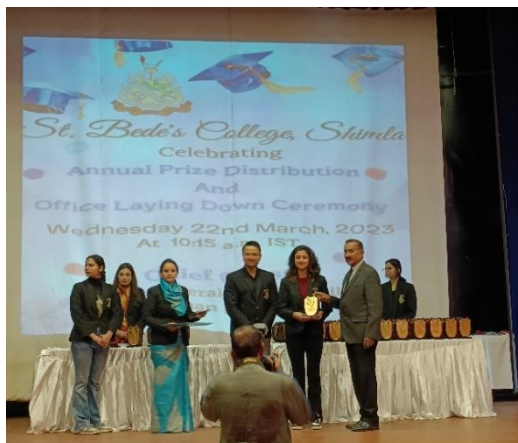
First Prize in English Honours