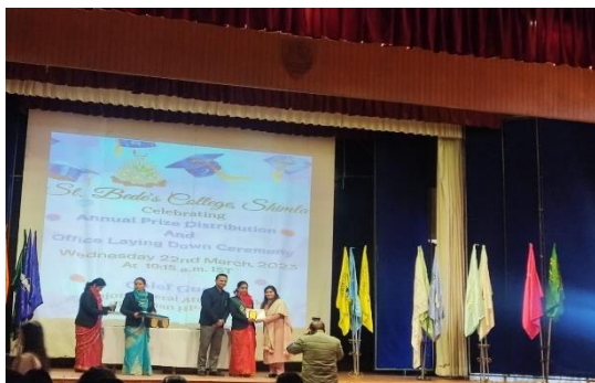
All Rounder prize, Commerce & Management