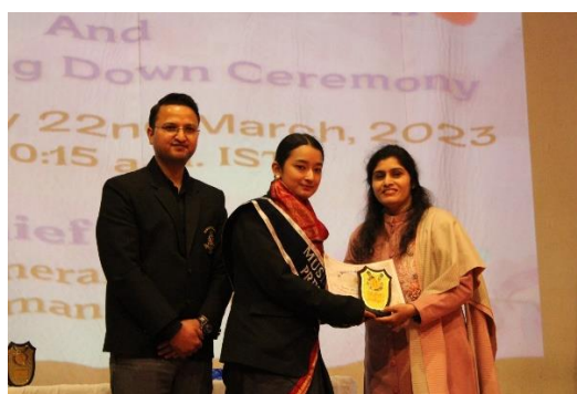
All Rounder, Psychology