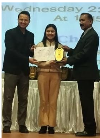
First Prize in B. Sc. Physics