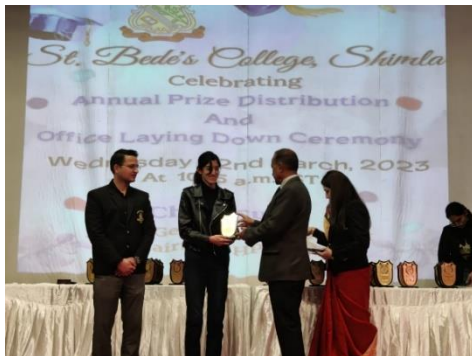
First Prize in Botany