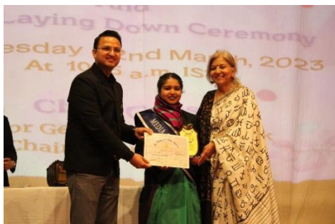
First Prize in English Honors