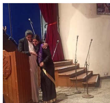
Bedeian Ring Holder