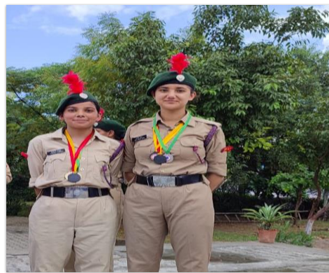
Advance Leadership Camp